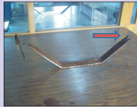
MS GUTTER CLAMP